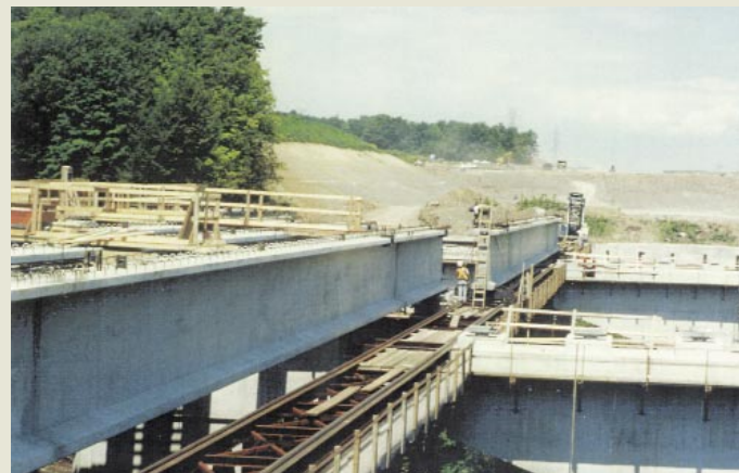
Highway 407 - Bronte Creek Bridge