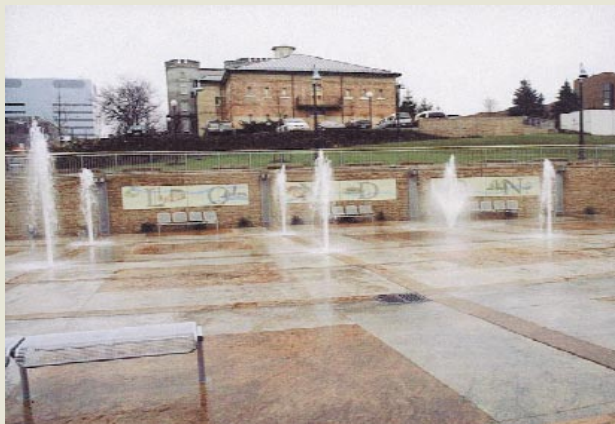
Forks of the Thames Revitalization