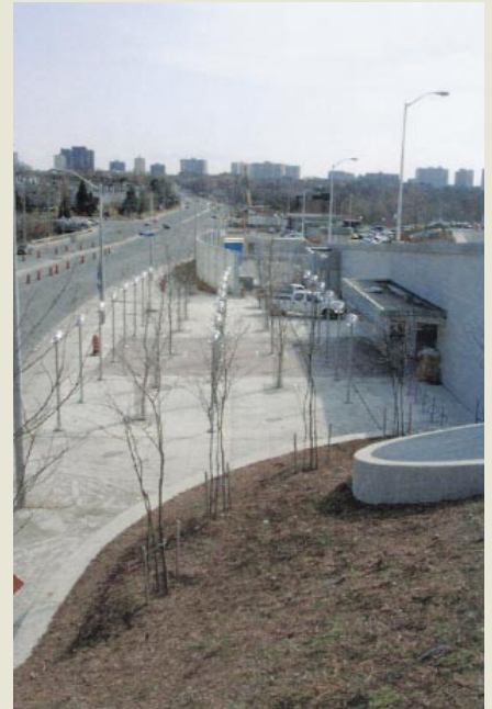
Sheppard Subway - Leslie Station