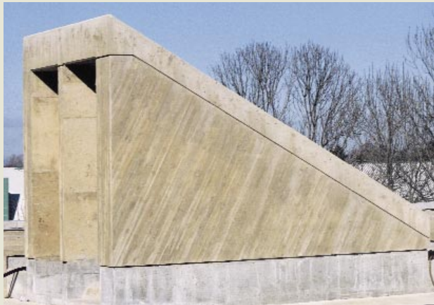
Sheppard Subway - Bayview Station